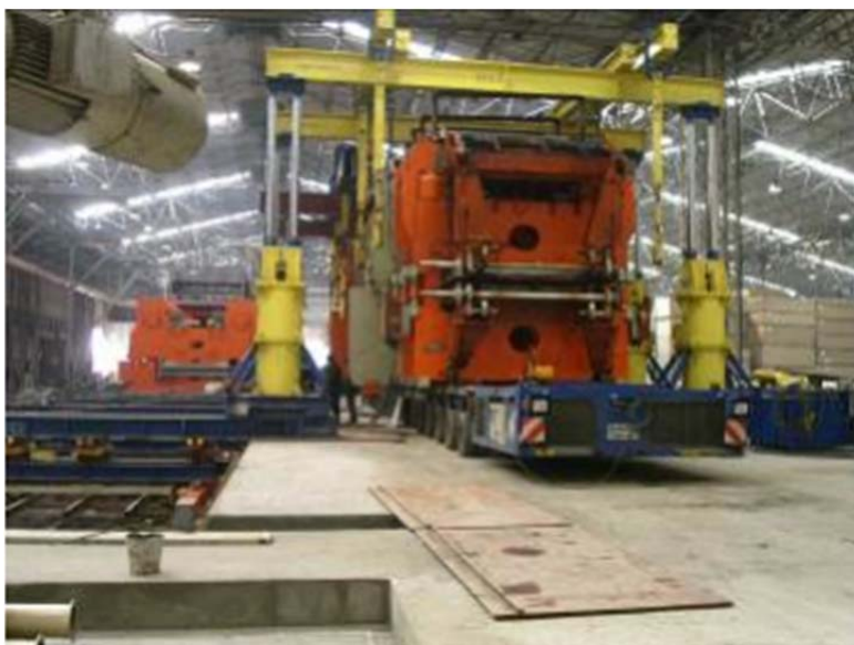
To extend a particle board press, it was necessary to move the complete press. First lift it of the pit, move it sideways and load it onto a self-propelled trailer. This gives way for the extension