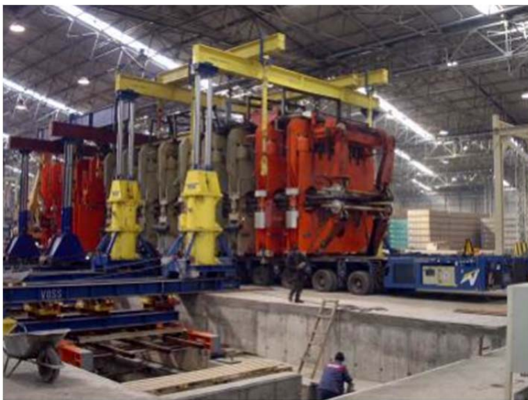
From planning to realization – comprehensive solutions even for the most difficult tasks